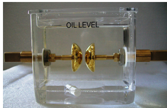
Oil Vessel OBDV-OV-1

Oil vessel with flat electrodes (OBDV-OV-3)